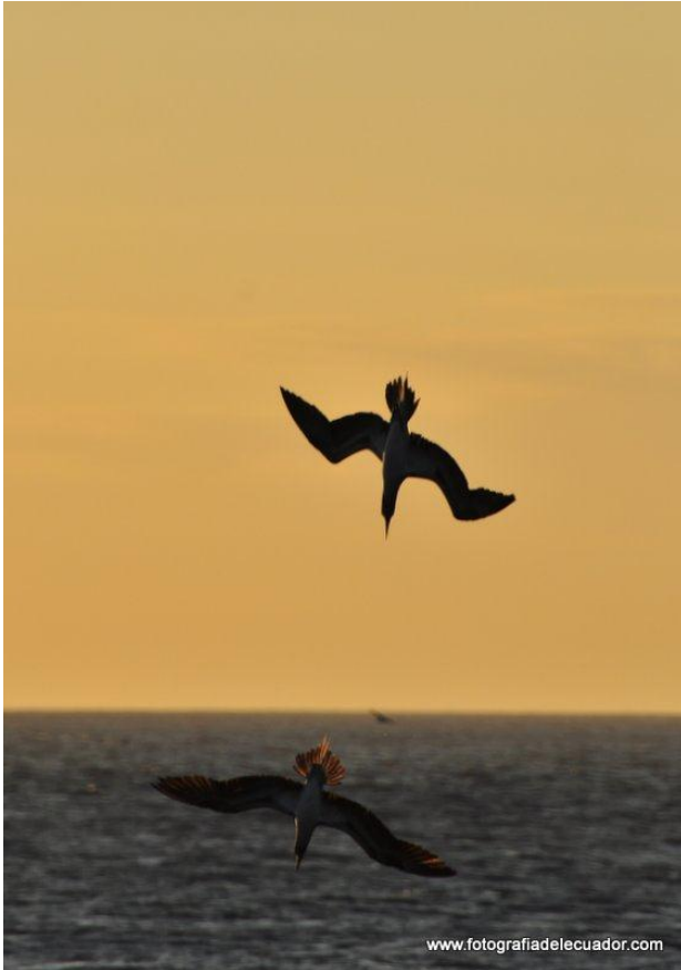
1/1250 sec ISO 200 f/9 These are two blue footed boobies fishing at sunset.