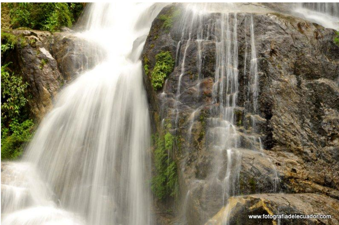
0.25 secs, ( ¼ ) f36, manual mode.