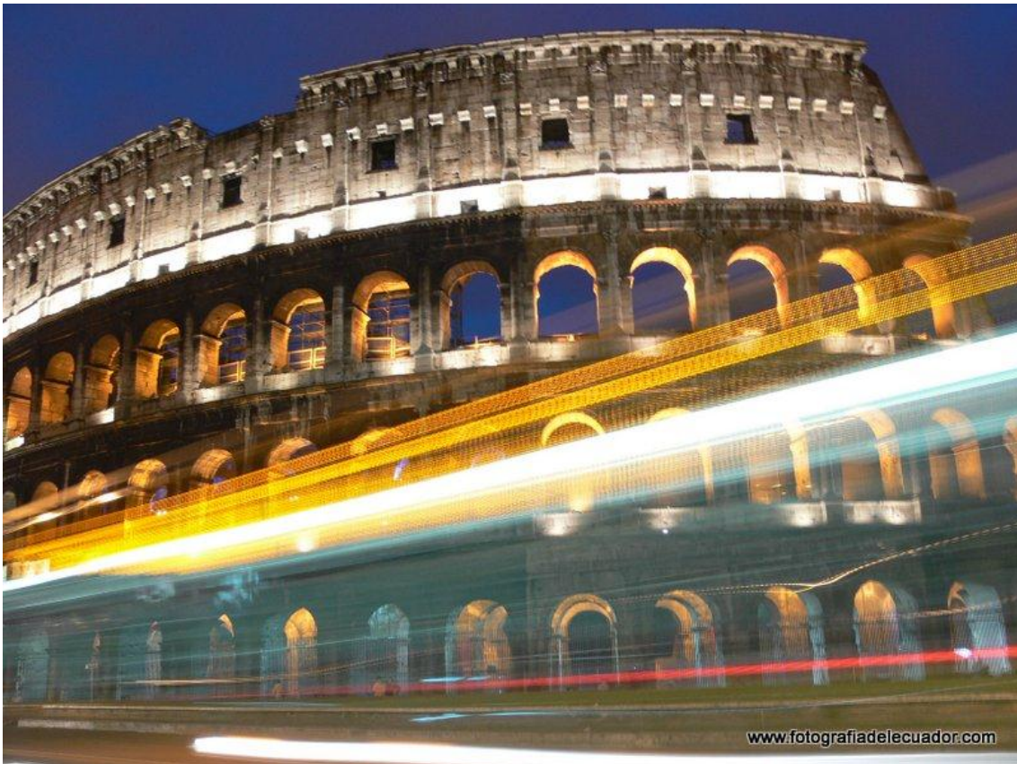
6 secs, ISO 80, f4.5 manual mode. A night time shot of the coliseum in Rome with light trails of a bus. This time I was without a tripod so I placed the camera on a trash can for stability.